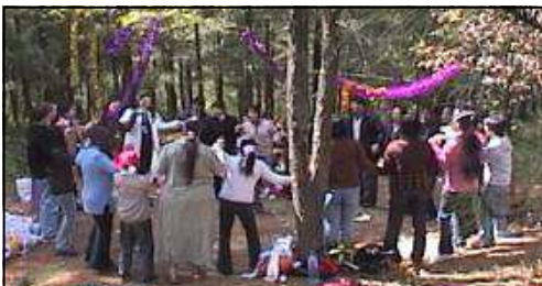
The Saint's could sing out loud and they were really belting it out. Holding hands, clapping and praising God for Jesus.

They suffered the consequences for their commitment to Jesus. The consequences were not as of the old days with such things as beatings or torturing. The consequences were more despicable. The government would not ever allow them a permit to become married. Or the government would not allow their parents to remain on dialysis under their nation-