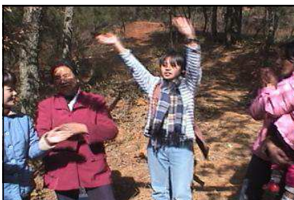
Singing, clapping and dancing to the Lord to reenact the birth of Jesus. A very spiritual experience to spend all day with such dedicated Brothers and Sisters in the Lord.

Yet these things have been happening to Christians all over the world since the very beginning of the apostolic age. The reason that they're hard for us to comprehend is because we have had it very easy here in the United States of