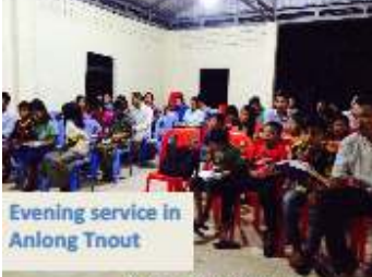
Evening service in Anlong Tnout

such a great way, we have added an evening service. Just like our church in Phnom Penh, they have a variety of ministries. Included in these ministries are a weekly prayer meeting on Tuesday, mid-week Bible study on Thursday, soul-winning on Saturday, and Children's